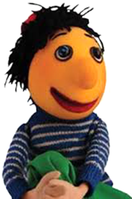
Figure 3. Red Hat Puppet

As a limitation of the current research, the individual differences of children (gender, age, etc.) could affect the anxiety score. It was tried to use randomization and control group to minimize these differences.